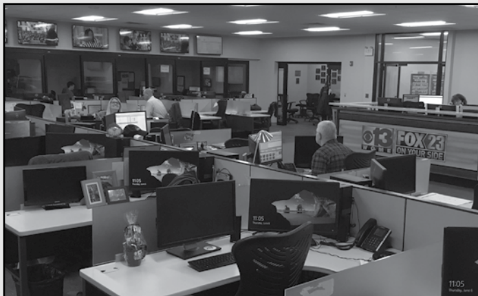
IBEW 1837 members on the WGME-TV News Team (seen here in their Portland newsroom) are being honored by the Radio Television Digital News Association in a several categories.