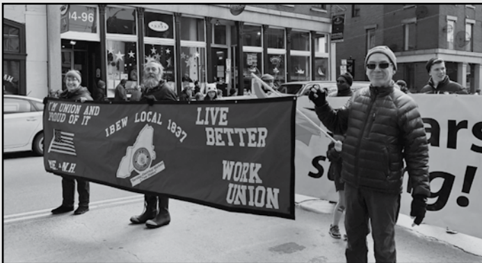
About a dozen different unions marched in Portland's St. Patty's Day Parade this year including IBEW Local 1837.