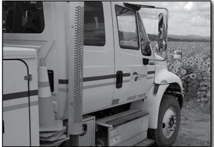
In most states, there are at least two workers in most vehicles that patrol power lines, but Maine has been an exception in spite of a state law that prohibits “distracted driving.”

If you find yourself in a situation where you must patrol or assess alone, it is your decision whether you think it would be safe to do so. If you are directed to do so by a supervisor and elect not to because you think it would be unsafe to patrol or assess alone and are disciplined, the Union will pursue the matter to arbitration. If, on the other hand, you do not want to risk discipline and decide to patrol or assess alone but feel it was unsafe to do so, please notify the Union and we will file a grievance and then pursue the matter to arbitration. Whatever your choice, the Union is committed to pursuing this matter to arbitration on behalf of any employee who feels it is unsafe to patrol or assess alone unless the Employer rescinds its practice or policy and agrees to assign two employees to patrol or assess for downed lines. The actual Maine law is seen below: