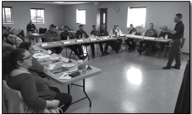
Introductory Steward Class