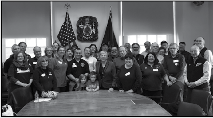
Members of IBEW 1837 and other Maine labor unions met with Gov. Janet Mills on the annual Labor Lobby Day to discuss issues important to working people and their unions.