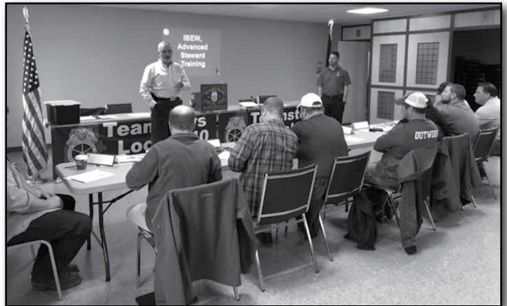
Advanced Steward Class