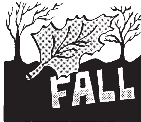
Flores / UCS